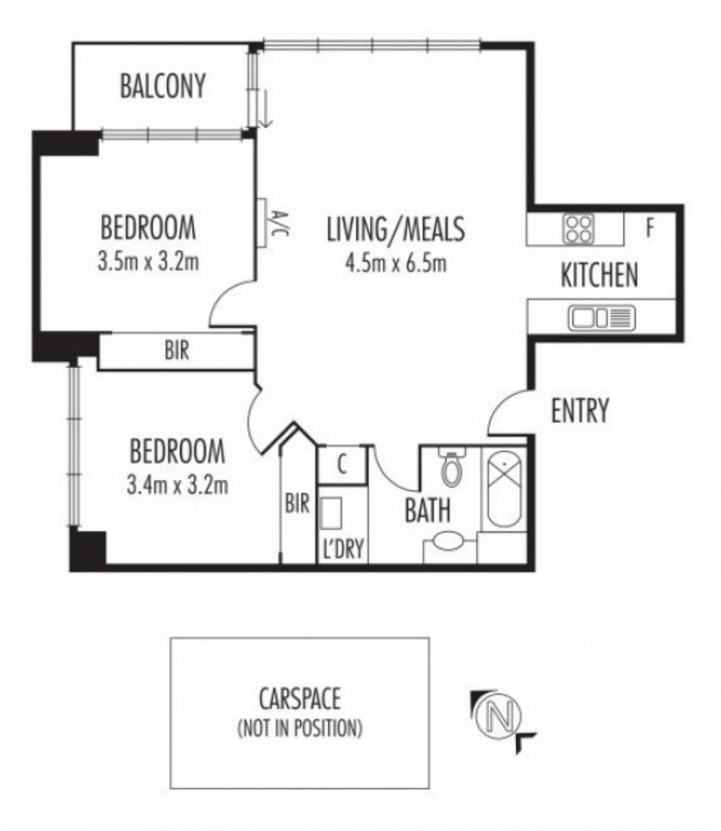
Disclaimer: Please note plans are indicative only and not drawn to exact scale. All dimensions are approximate. Potential buyers should satisfy themselves of any pertinent matters.